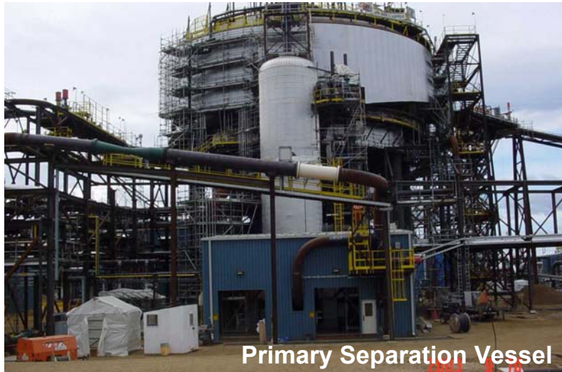
Primary Separation Vessel